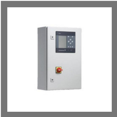
Pump Automation Control Panel