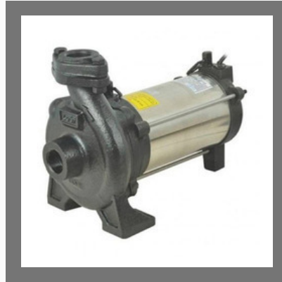
Openwell Submersible Pump