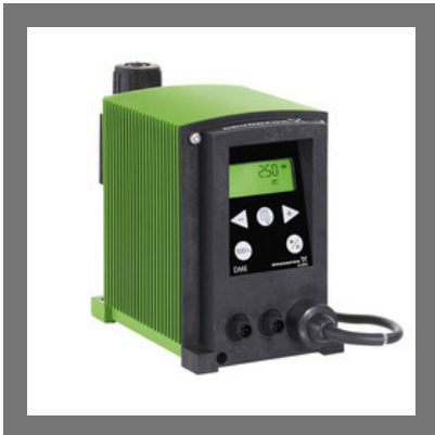
Digital Dosing Pump