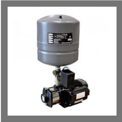
Grundfos Pressure Booster Pump