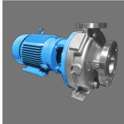
Chemical Process Pump