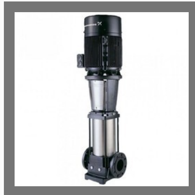
Grundfos Vertical Multistage Centrifugal Pump