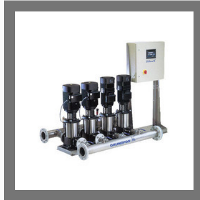
Hydro Pneumatic Pressure Booster System