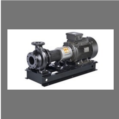
Centrifugal Water Pump