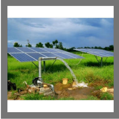
Solar Water Pump