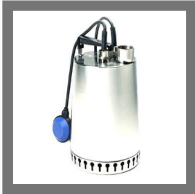
Portable Dewatering Pump