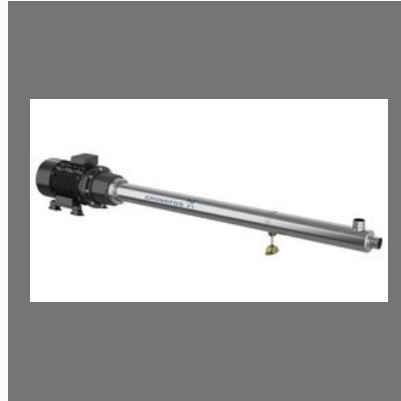
High Pressure Multistage Pump for RO