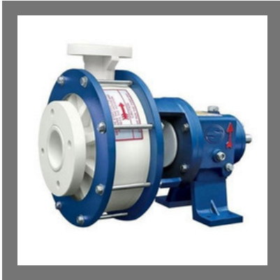
Polypropylene Chemical Process Pumps