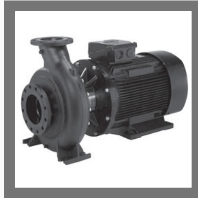
Back Pull Out Centrifugal Pump