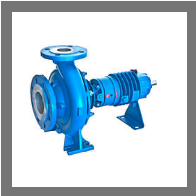
Centrifugal Air Cooled Hot Oil Pumps