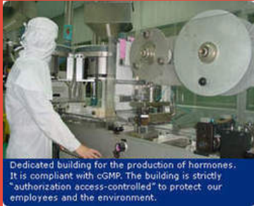
Surgical Cotton Machine For Pharma Industry