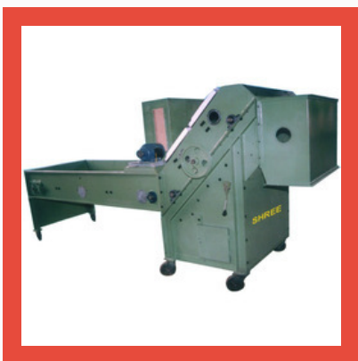
Super Bale Opener