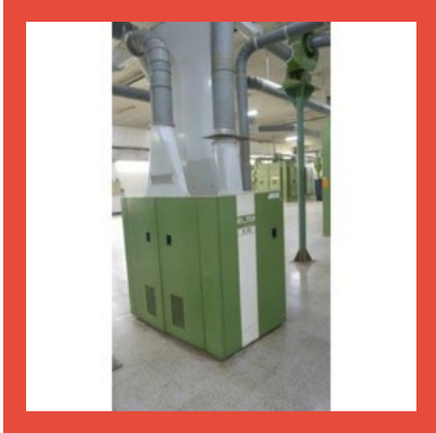
Feed Trunk Blow Room Machine