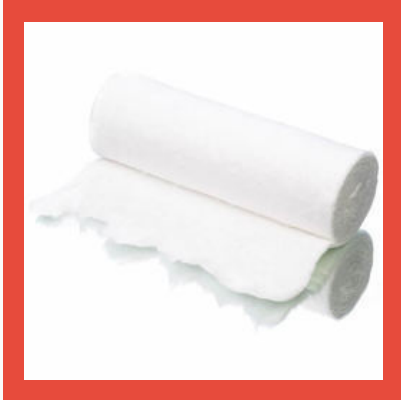
Cotton Wool Roll