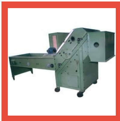
Wet Cotton Opener