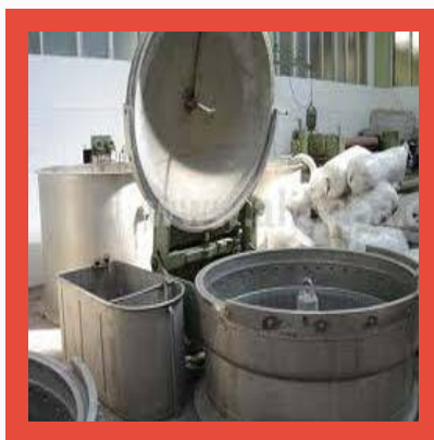
Turnkey Projects for Surgical Cotton