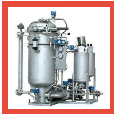
HTHP Vertical Fiber Dyeing Machine