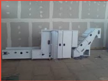
MBO Cotton Machine