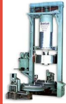
Consultant for Surgical Cotton Industries