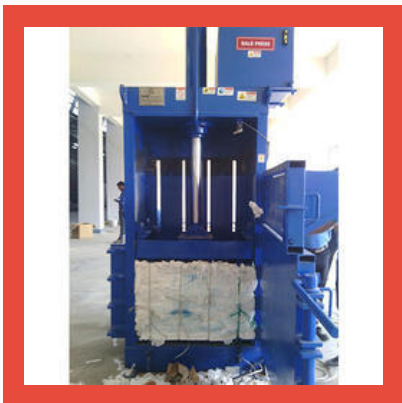
Cotton Bale Press