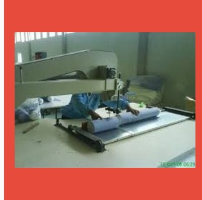
Cotton Roll Cutting Machine