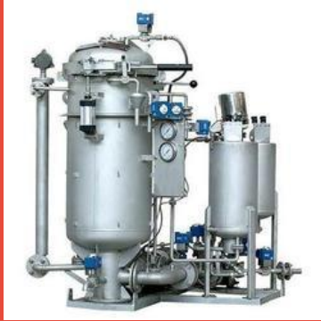
Fully Automatic Surgical Cotton Unit