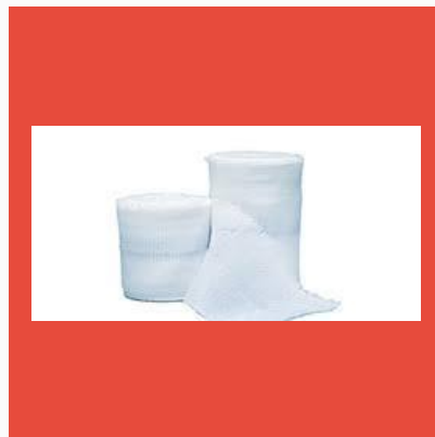
Cloth Roller Bandages