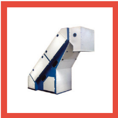
SRS6 Textile Machines