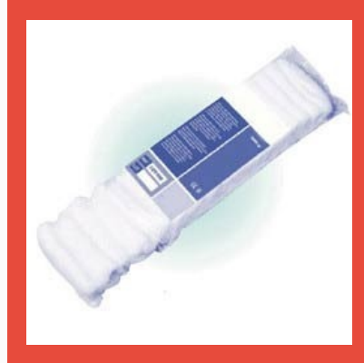
Zig Zag Cotton