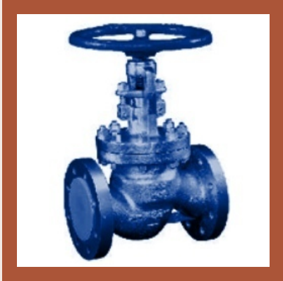
KSB Cast Globe Valve