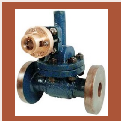
Neta Cast Carbon Steel Parallel Slide Blow Down Valve