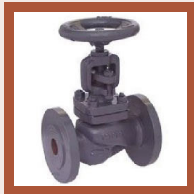
Zoloto Cast Iron Globe Steam Stop Valve Flanged