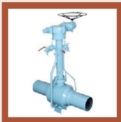
Cast & Forged Valve