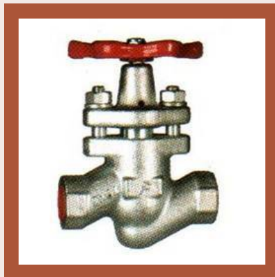
Forbes Marshal Piston Valve SCR / SOC