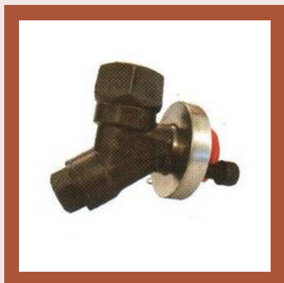
Forbes Marshal Universal Thermodynamic Steam Trap Valve