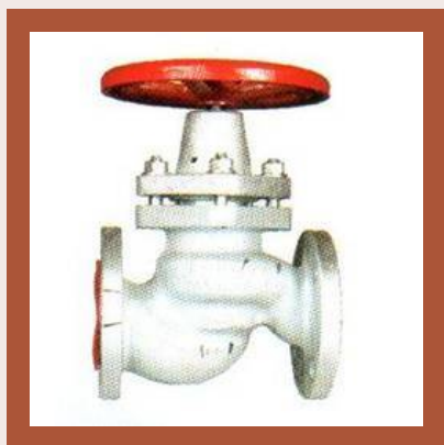
Forbes Marshal Piston Valve Flanged ANSI 150 / 300