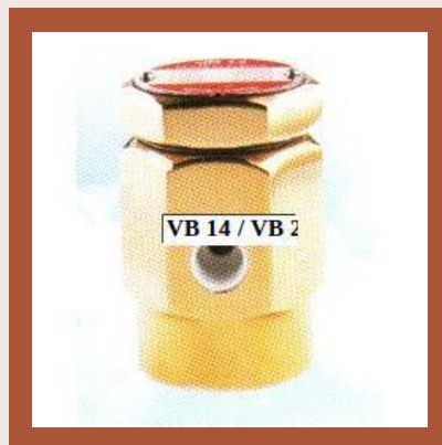
Forbes Marshal Vacuum Breaker