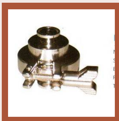
Balance Pressure Thermostatic Steam Trap Valve