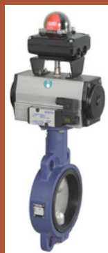
Rotex Pneumatic Butterfly Valve