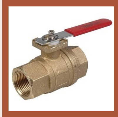
Brass Ball Valves