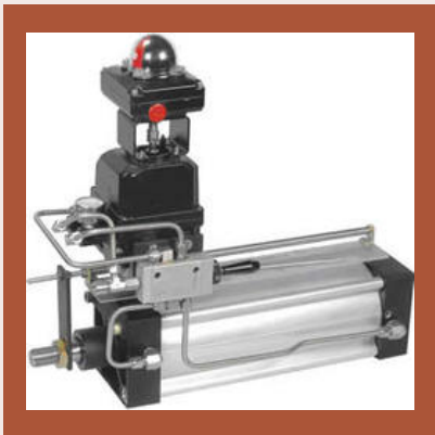
Rotex Power Cylinder with Accessories