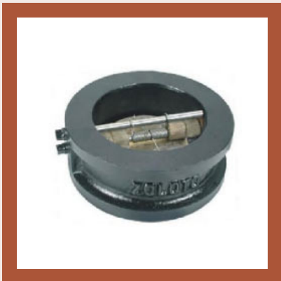
Zoloto Cast Iron Dual Plate Check Valve