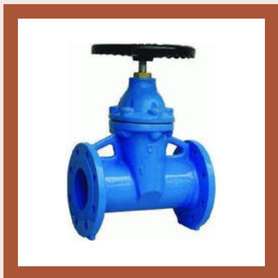
Cast Iron Valves