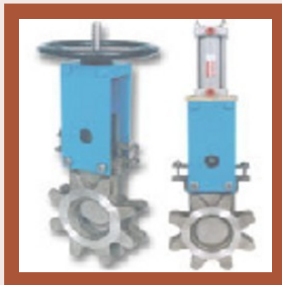
Expert Knife Edge Gate Valve