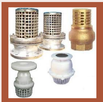
Specialty Foot Valve