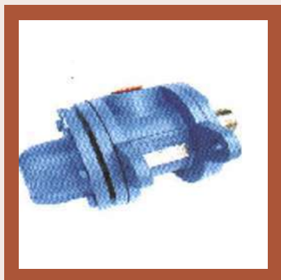
Forbes Marshal Rotary Joints