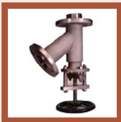
Specialty Flush Bottom Tank Valve