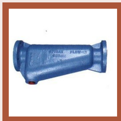
Forbes Marshal Moisture Separator