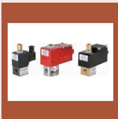
Rotex 2 Port Direct Acting Normally Open Solenoid Valve