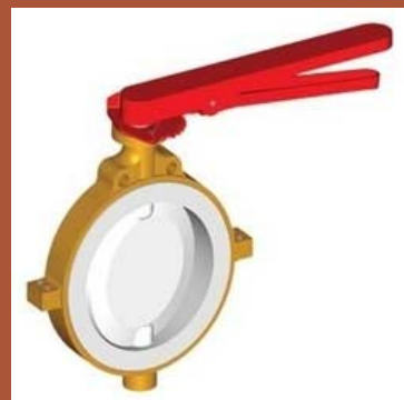
Lined Butterfly Valve