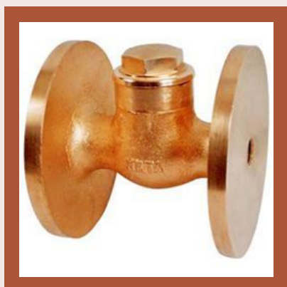
Neta Bronze Horizontal Lift Check Valve