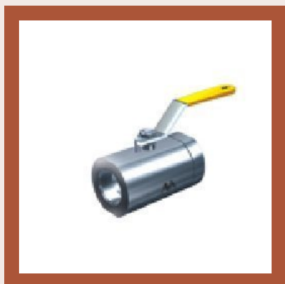
Microfinish One Piece Screwed Valve