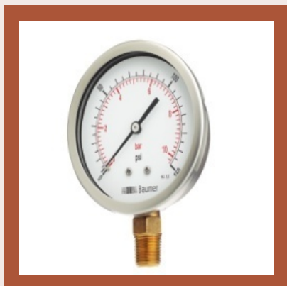
Baumer SS Case Brass Pressure Gauge Bourdon Type