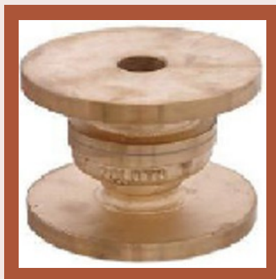
Zoloto Bronze Vertical Lift Check Valves