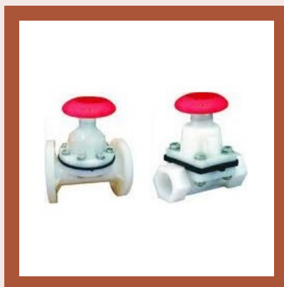
Plastic PP Diaphragm Valve