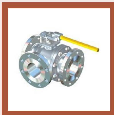
Microfinish Cast Two Piece Three Way Flanged Valve