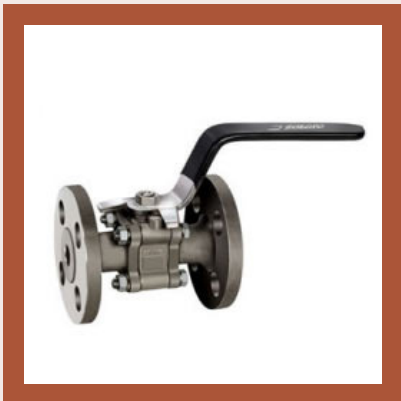
Zoloto Cast Steel Three Piece Design Ball Valves