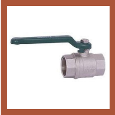
Zoloto Forged Brass Ball Valve