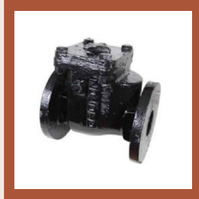
Zoloto Cast Iron Non Return Valve