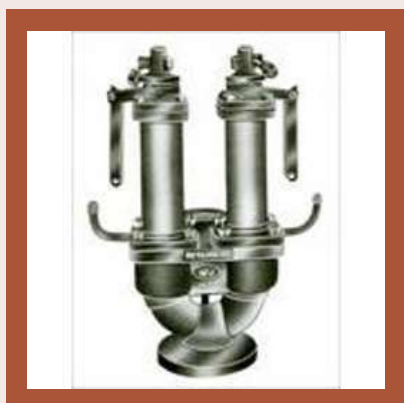
Neta Cast Iron Spring Loaded Safety Valve