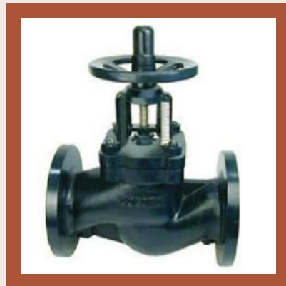
Zoloto Cast Iron Double Regulating Valve