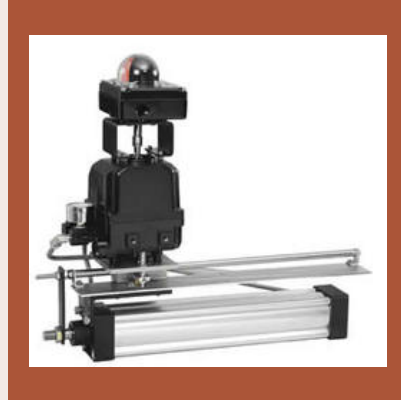
Rotex Elector Pneumatic Power Cylinder