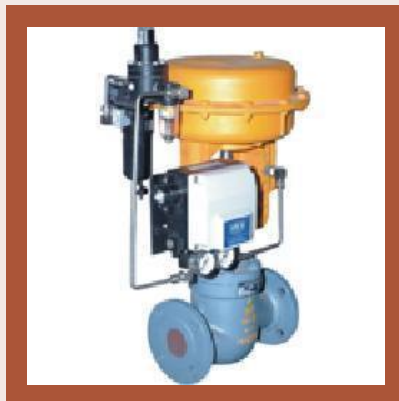
Pneumatic Diaphragm Operated Hot Water Control Valve