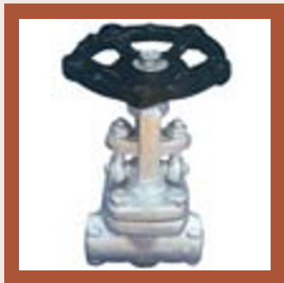
Expert Forged Steel Valves