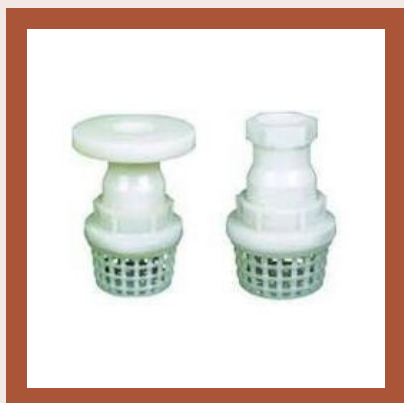
Plastic PP Foot Valve