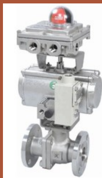
Rotex Stainless Steel Ball Valve with Rotary Actuator