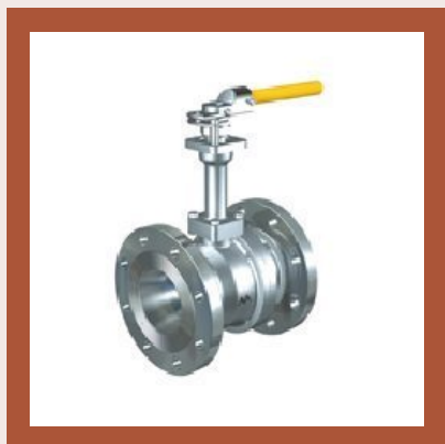
Cast & Forged Cryogenic Flanged Valve