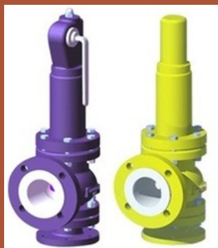
Lined Pressure Relief Safety Valve