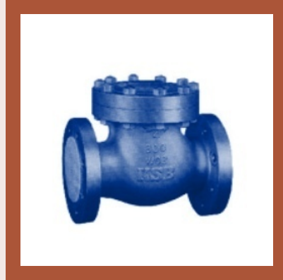
KSB Cast Check Valve