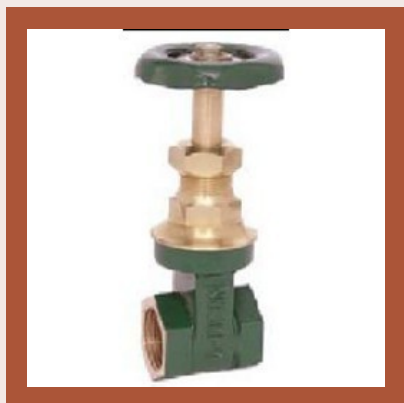
Zoloto Bronze Fullway Valves