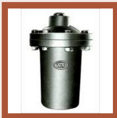
Neta Cast Steel Inverted Bucket Type Steam Trap Screw Valve