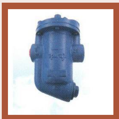
Forbes Marshal Inverted Bucket Steam Trap Valve