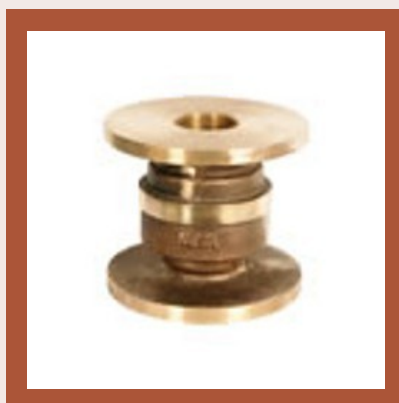
Neta Bronze Vertical Lift Check Valve