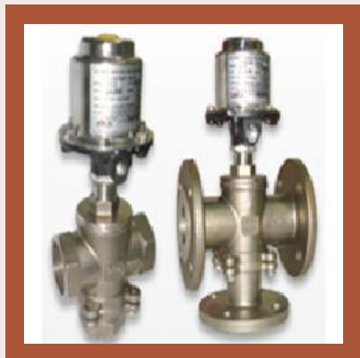
Control Pneumatic Cylinder Operated Medium Pressure