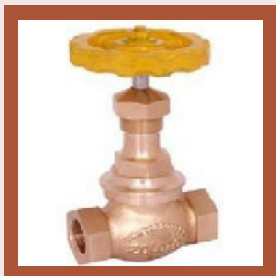
Zoloto Bronze Union Bonnet Wheel Valve