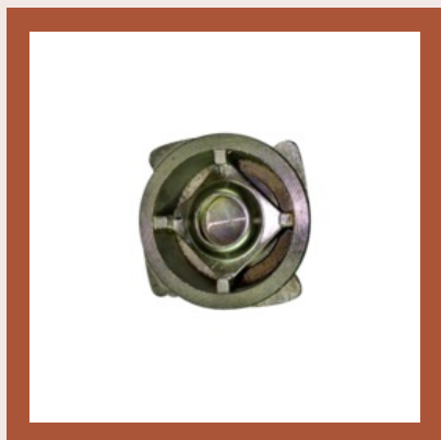
Disc Check Valves