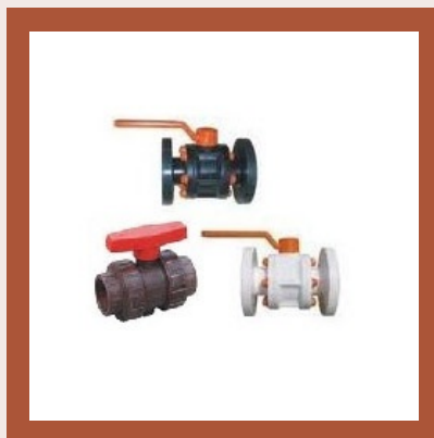
Plastic PP Ball Valve