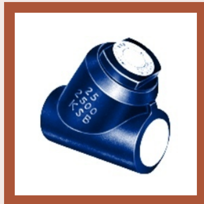
KSB Forged Check Valve