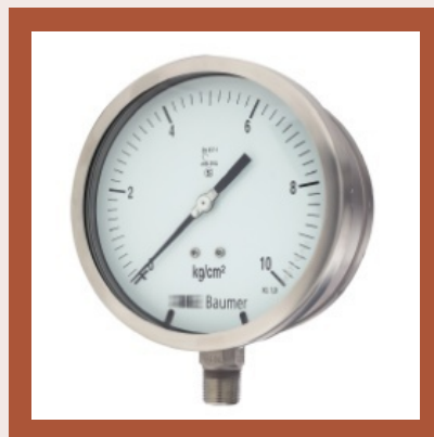
Baumer All SS Pressure Gauge Solid Front