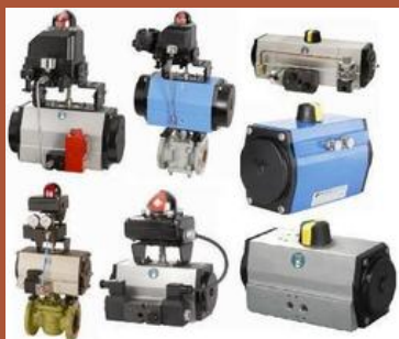
Rotex Pneumatic Actuator