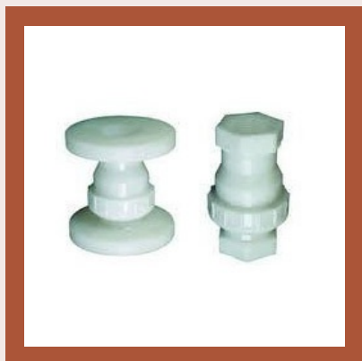
Plastic PP Non Return Valve