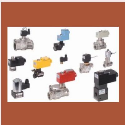
Rotex 2 Port Solenoid Valve