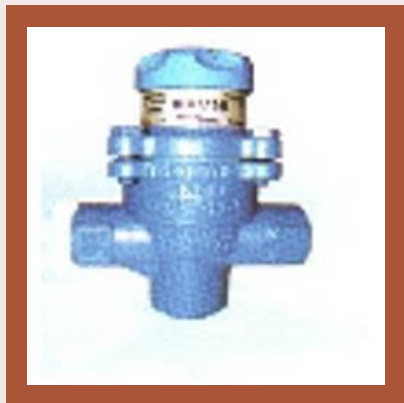
Forbes Marshal Pressure Reducing Valve