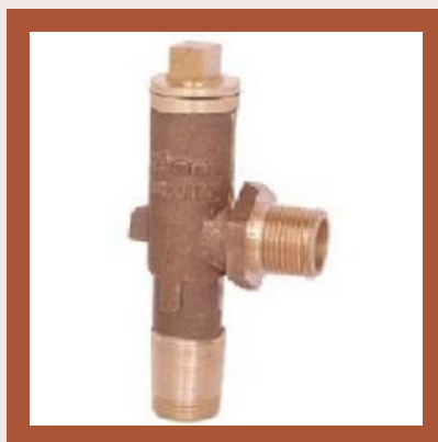
Zoloto Bronze Ferrule Cock