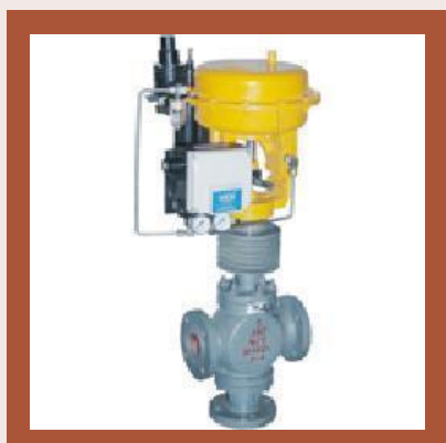
Control Pneumatic Diaphragm Operated Valve