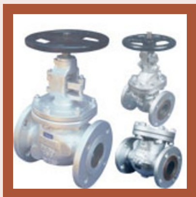
Expert Gate Globe Check Valves