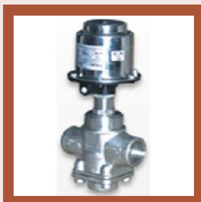
Control Pneumatic Cylinder Operated High Pressure