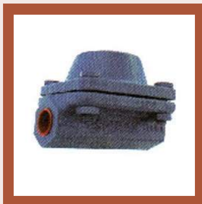
Thermostatic Steam Trap Valve with Integral Strainer