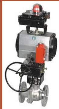
Rotex Pneumatic Ball Valve