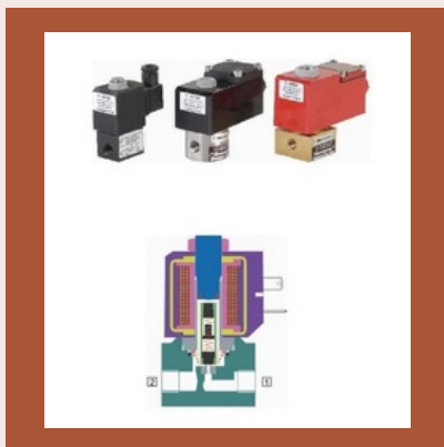
Rotex 2 Port Direct Acting Normally Closed Solenoid Valve