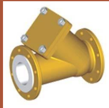
Lined Ball Check Valve Y Type