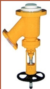
Lined Flush Bottom Tank Valve