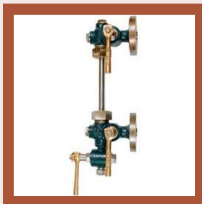
Neta Cast Carbon Steel Sleeve Packed Water Level Gauge