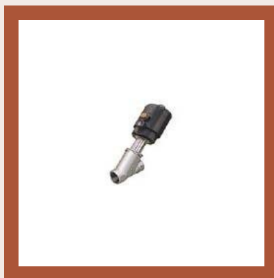
Forbes Marshal Piston Actuated Valve