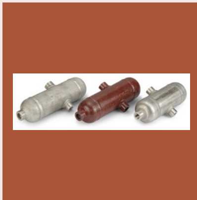
Specialty Condensate Pot