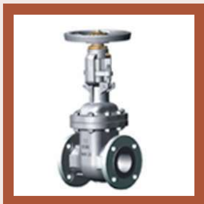
Neta Cast Iron Gate Valve Outside Screw