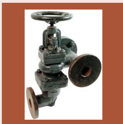
Neta Cast Iron Accessible Feed Check Valve