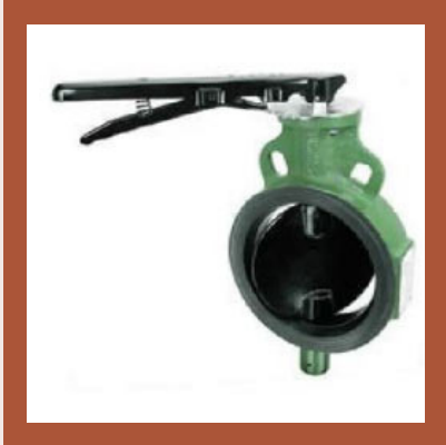
Zoloto Cast Iron Wafer Type Butterfly Valve