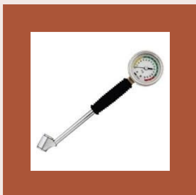
Baumer Tyre Pressure Gauge Bourdon Type