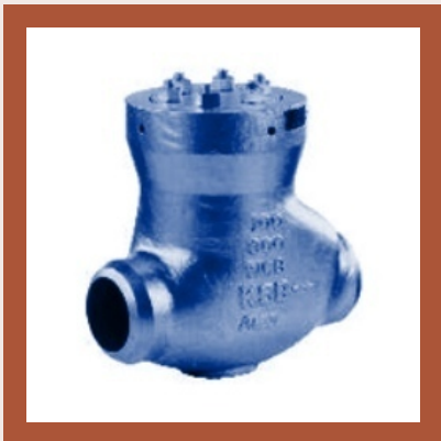
KSB Pressure Seal Check Valve