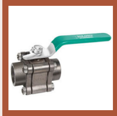
Zoloto Cast Steel Three Piece Design Ball Valves