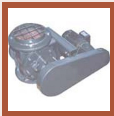
Expert Rotary Air Lock Valves