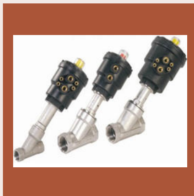
Rotex Double Acting Angle Seat Valve